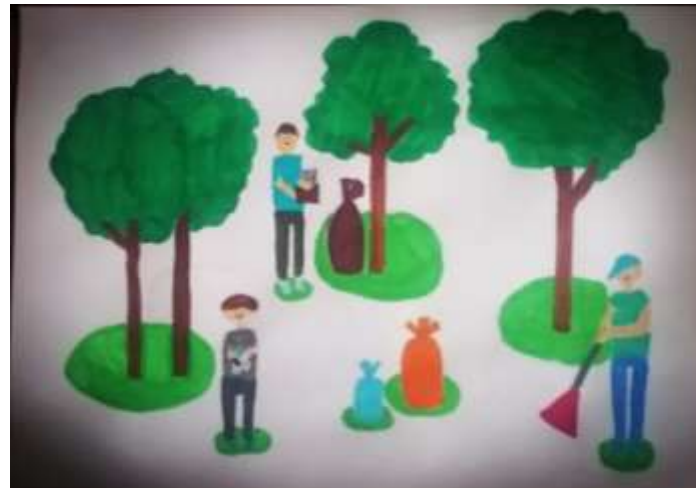
– Drawing created by MARIA PORCEANU